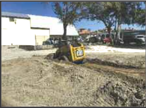
The first stage of work with the lot being graded smoothed.