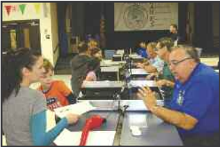
Masons in a row preparing personal ID packages

Englewood Masons, in collaboration with the Vineland Elementary School, as part of Vineland’s Spring festivities provided Child ID services. The huge School-wide Festival of Activities included the Sheriff’s helicopter, K-9 units, School Band, Games, Hamburger & Hot Dog booths, and other events. The Child ID Program is another community service provided free-of-charge by Florida Masons. It is designed to help provide security for our loved ones should they find themselves in harms way. A Childs vital statistics are recorded on a DVD including visual image, fingerprints, verbal recording, additional data unique to each child and a DNA specimen. All of this is provided to the parent or legal representative at the conclusion of each sitting. All material is recorded using computers and nothing remains resident on the equipment ensuring total confidentiality to the individuals. The Englewood Masonic Lodge No. 360 has offered this community service for several years since the Grand Lodge of Florida first endorsed it. The age range is flexible. Usually some verbal skills are desired in the younger participants, and upper limits include youth not yet independent. If you have a group or are part of an organization of young people and want to provide an extra measure of protection for them, call the Lodge and schedule a group session. We can come to you. 941.475.9211