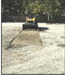
The trench with the CAT removed.