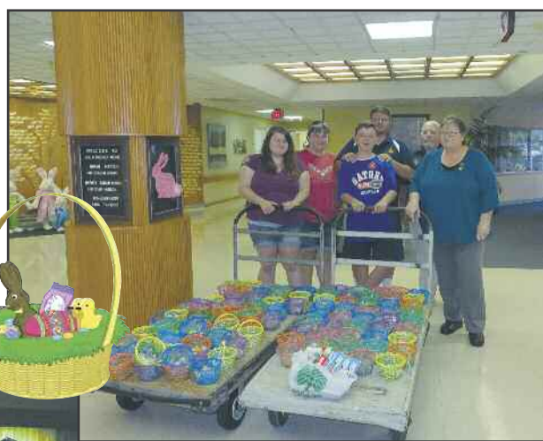
Lake Wales Lodge No. 242 delivers Easter Baskets for each Resident