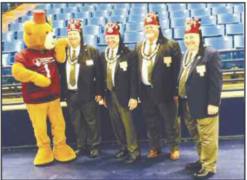
Grand Lodge Elected Officers received at the East West Shrine Game to benefit the Shrine Hospitals for Children.