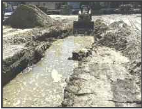
The beginning of excavations to create a trench for water removal.