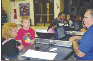
Collect necessary data onto computer in a few minutes.