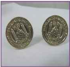
The Masonic Charities, Inc., is a 501(c)(3) corporation and your donation is Tax Deductible.