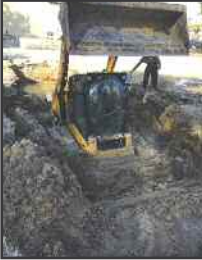
The trench being dug, then “We’re sank.”