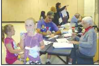
Registration, forms and cotton candy.