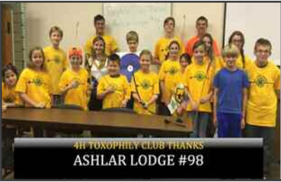
4H TOXOPHY CLUB THANKS ASHLAR LODGE #98