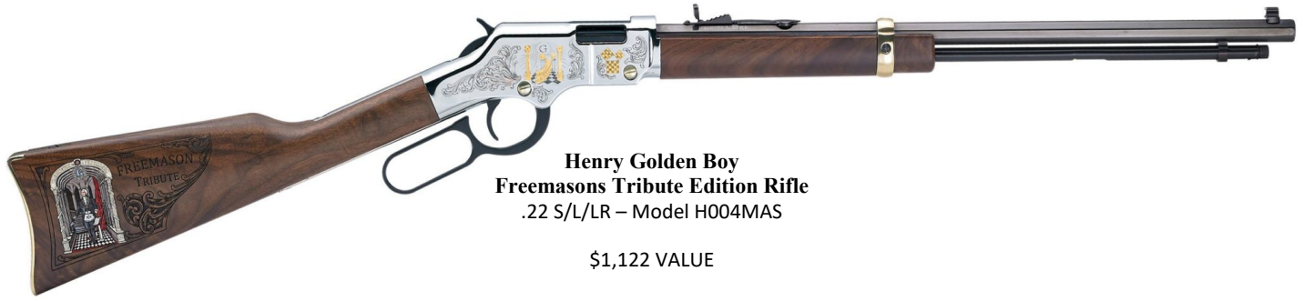
Henry Golden Boy Freemasons Tribute Edition Rifle .22 S/L/LR – Model H004MAS