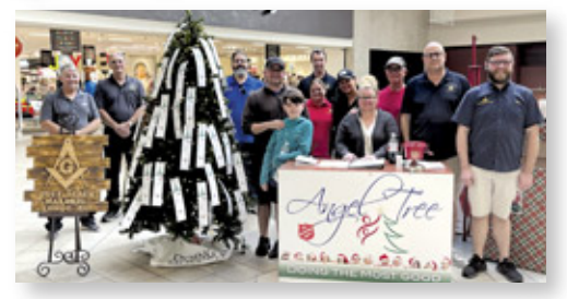
Pictured here are Members, and their families helping at the Angel Tree.

allowing them to take part in this worthy program. The Lodge also encourages other organizations and individ-