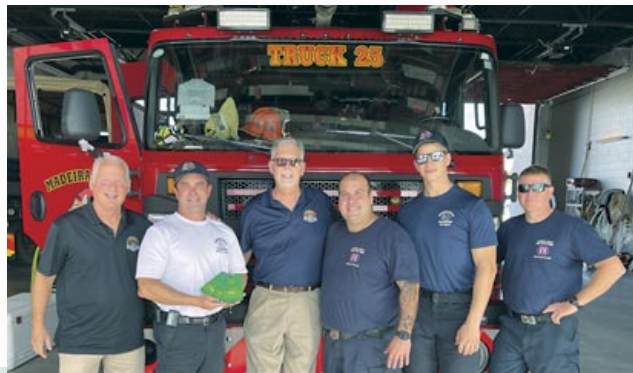
Gulf Beach Lodge is located at 14020 Marguerite Dr., Madeira Beach

Gulf Beach Masonic Lodge No. 291 recently presented our firefighters at Madeira Beach Fire Department a $300.00 gift card to Publix. This simple gesture was to show our grateful appreciation for the hard work these local heroes have been performing since hurricane Helene and Milton devastated the beaches. We salute the brave men and women who serve and protect us every day. Gulf Beach Masonic Lodge was not spared the effects of the storms and is currently in the process of rebuilding the ground floor of the Lodge. We, as so many of our neighbors on the beaches, hope to return to some sense of normalcy in the near future. ✕