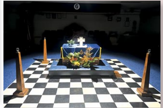
Tribute to Dick Wenzel