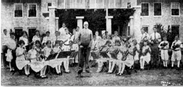
1927 Masonic Home Orphanage Orchestra

Throughout the 1930s, and 1940s, the Masonic Home continued to grow, supporting Florida Masons, their widows, and orphans.