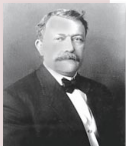
Albert Gilchrist, Grand Master

In 1902, Brother Albert Gilchrist, who would later become Most Worshipful Grand Master and Florida's 20th governor serving in both positions at the same time, proposed establishing a Masonic Home. He served as the first chairman of the Board of Trustees, a position he held from 1902 to 1926. Upon his passing, Gilchrist bequeathed a substantial portion of his estate to support the future Masonic Home.