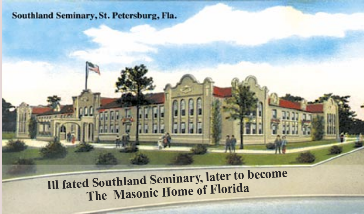
Ill fated Southland Seminary, later to become The Masonic Home of Florida